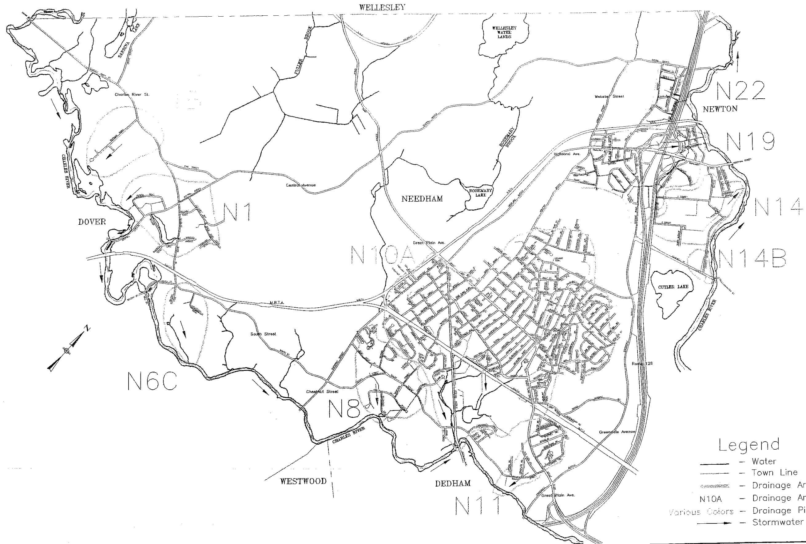
Figure 2.1 – Stormwater Drainage Areas Needham Stormwater Management