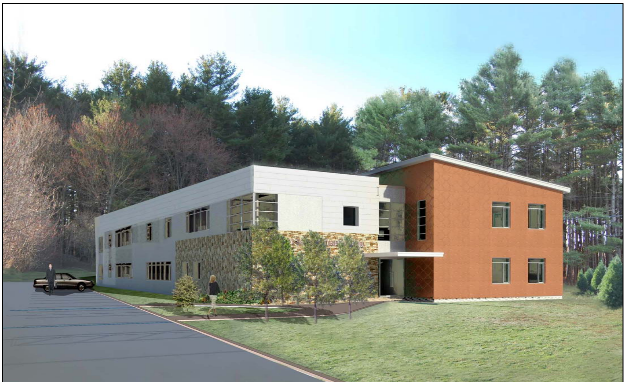
View of the Public Services Administration Building from the Water Pumping Station.

There are several other facilities located at the DPW Complex. The former water pumping station continues to serve consolidated Water & Sewer Division functions. The site also hosts several equipment sheds, storage stockades, a salt shed, and a trailer used for snow and ice operations. In the 1960's, to meet the needs of the community, a large portion of the former Norris Farm parcel was transferred to the Park and Recreation Commission (about 8 acres) and School Department (about 11 acres) to create DeFazio Park.