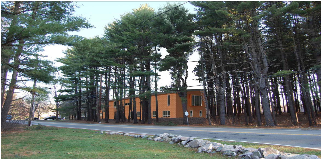
View of Public Services Administration Building from Dedham Avenue

The Need: The current DPW facility is too small for department needs, and associated garage space is inefficient and inappropriate. The second floor office space has only a fire escape as a second means of egress, there is no handicap accessibility, and there is a history of air quality concerns relating to fumes from the garage below the office spaces.