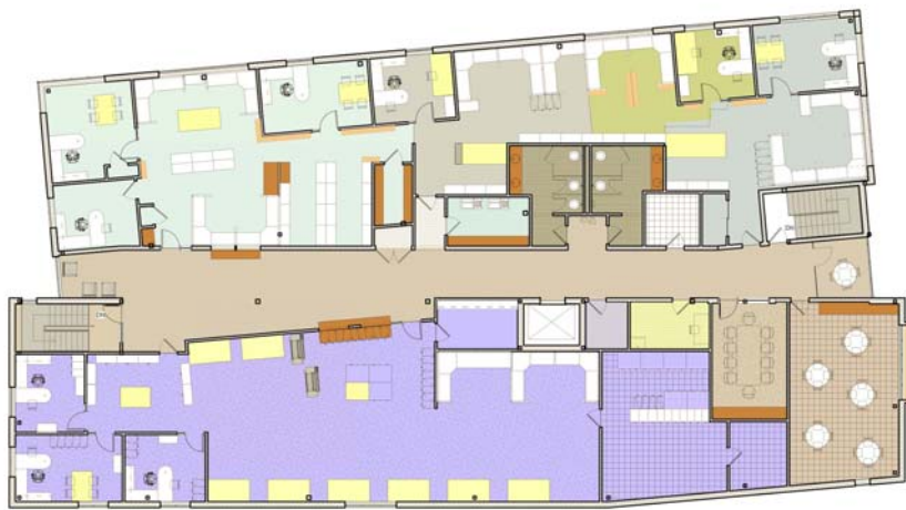
Preliminary Schematic Design First Floor Layout